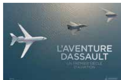
The cover of the new book, "The Dassault Adventure: a First Century of Aviation".

Also online will be a historical timeline of the Dassault story, videos based on memories by Dassault's former leaders, and new 3D screen-savers.