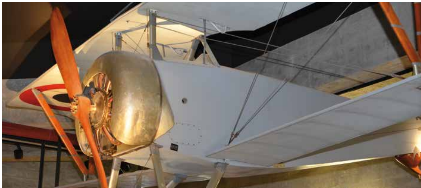
Nieuport 17 aircraft equipped with an Eclair propeller Verdun_0004-1.jpg