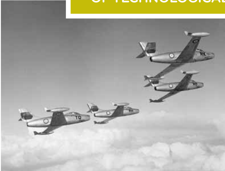
A patrol flight of four MD 450 Ouragan fighters 86-1017_T-1.jpg

The advanced aerodynamic design of the Éclair propeller in 1916 gave it unprecedented efficiency. It was only the first link in a long chain of technological advances that would mark the history of Dassault Aviation. Whether Dassault invented these innovations, or was just one of the first to apply them, they are one of the underlying factors in the company's development. Furthermore, one of Dassault's defining characteristics is that it has built up this experience and expertise almost without interruption – an essential advantage for long-term survival in the demanding aerospace industry.