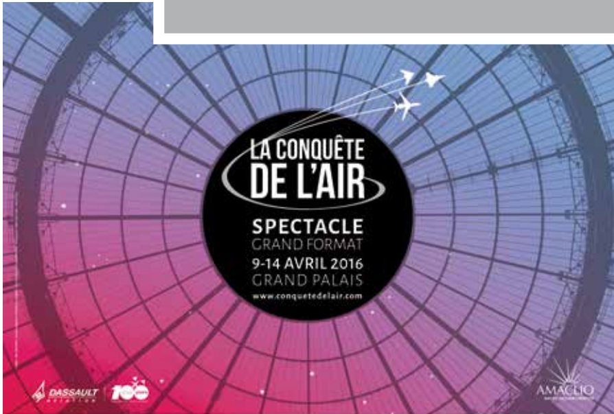
A poster announcing the show in Paris celebrating Dassault Aviation's 100th anniversary

LCDLA_GP_AMACLIO_4X3_29_10_2015.jpg conception Amaclio & agence Anastase