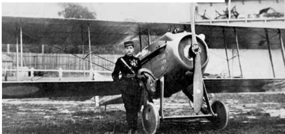
World War I ace, Georges Guynemer, in front of a Spad VII equipped with an Eclair propeller 18597_T.jpg

After graduating from the École supérieure d'aéronautique et de construction mécanique engineering school, Marcel Bloch (later known as Marcel Dassault) was drafted into the French army in October 1913, in an aeronautical engineering regiment. In January 1914, he was assigned to the Chalais-Meudon aeronautical research lab, comprising several workshops that studied all the technologies needed for the budding field of aviation.