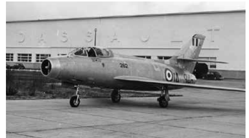
Indian Air Force Mystère IV 09-b662888.jpg

For the last 50 years, Dassault Aviation has exported about 72% of its production to a hundred countries. For Falcon business jets, this figure climbs to over 90%. Since the French market for both civil and military aircraft is necessarily limited, Dassault has always focused on exports.