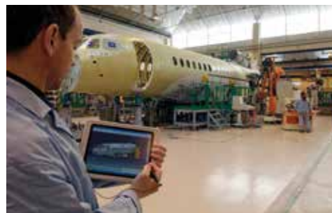
Dassault Aviation's plant in Biarritz, southwest France _DSF8702.jpg