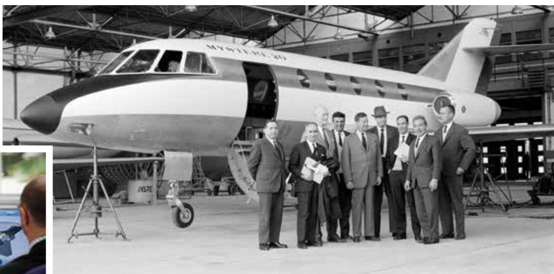
A Pan Am delegation including Charles Lindbergh visits Dassault's Mérignac plant on May 4, 1963 to check out the Mystère 20 70632_T-1.jpg

aircraft, but it also turned out excellent civil models. Technical solutions developed for the Communauté twin-engine liaison plane were combined with solutions from the Mystère IV, enabling Dassault to create the Mystère 20 business jet, the first model in the Mystère-Falcon family. Once again, it was the United States that sealed the reputation of a Dassault product, since Pan Am was the first to order this model, initiating a breakthrough in the American market. This first bizjet would lead to a smaller derivative, the Falcon 10 twinjet, and the larger Falcon 50 trijet, offering transatlantic range. The success of the subsequent Falcon 900 and Falcon 2000 models in the 1980s and 1990s confirmed Dassault's technological expertise in premium business jets.