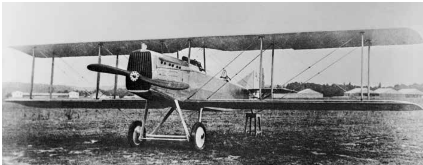
SEA IV on the ground