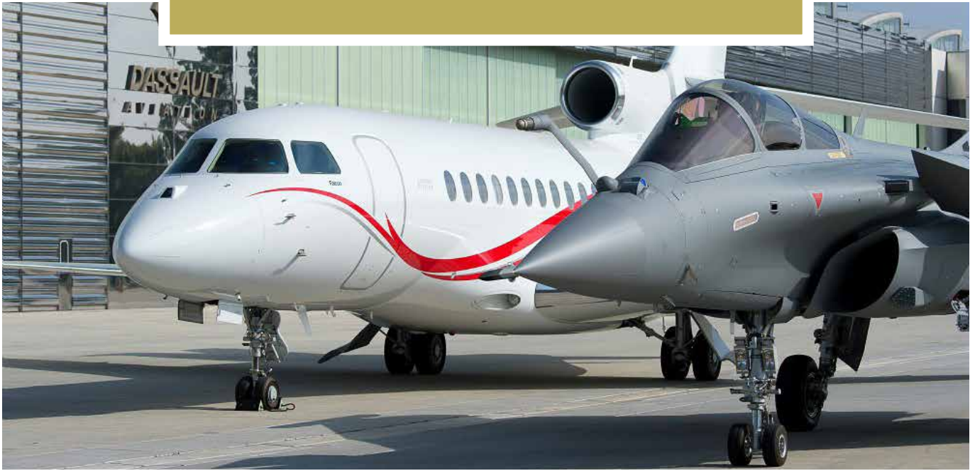
A Falcon 7X and Rafale C on the ground in Mérignac _STR4104r.jpg

Dassault Aviation has always applied a dual (civil-military) technology strategy, an integral part of its DNA that ensures the company's balance. The products for these markets are complementary, providing effective protection against fluctuating political and economic conditions.