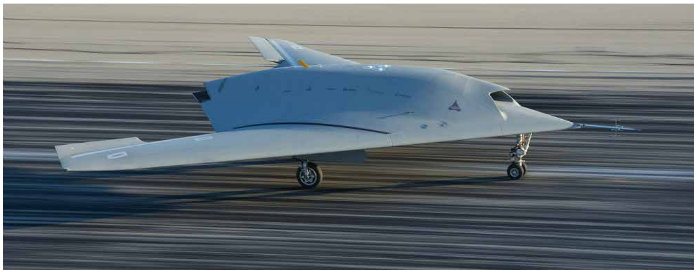
Europe's nEUROn UCAV technology demonstrator taking off from Dassault's flight test center in Istres, southern France AP_PGXI704.jpg © Dassault Aviation - Alex Paringaux

Aviation has also shown its interest in developing combat drones, especially within the scope of the French-British FCAS (Future Combat Air System) program, as well as medium-altitude, long-endurance (MALE) drone systems.