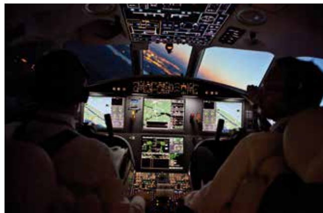
EASy II flight deck IMG_7103-1.jpg

As early as 1978, the Falcon V10F was the first and only civil transport aircraft in the world to be certified with a carbon wing. Since then, all Dassault aircraft have used composite materials. They account for fully 25% of the Rafale's weight.