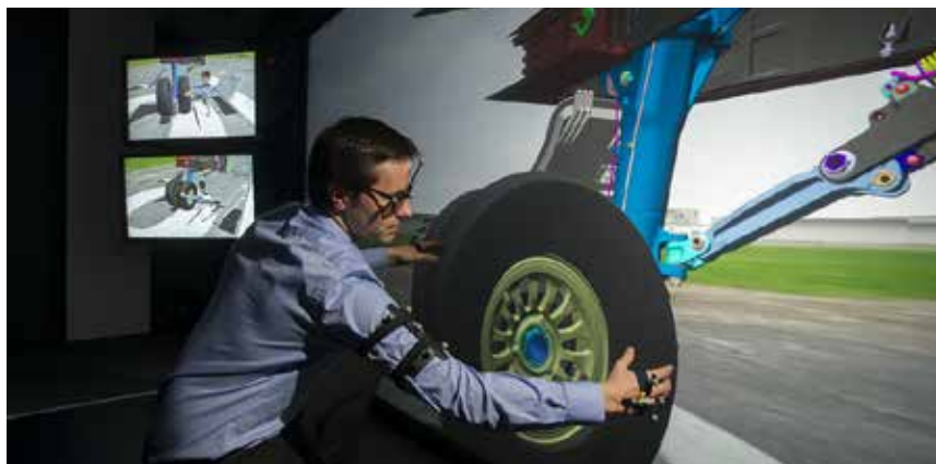
Falcon 5X - Immersive Reality Center (IRC), Saint-Cloud, France 118_Falcon5X_2013DVD43.jpg