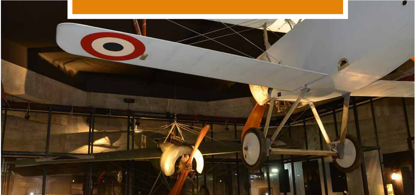
A French Nieuport 17 and German Fokker E.III face off over a reconstituted battlefield Verdun_0001.jpg

Aerial combat over the Verdun battlefield can be considered the first real "air battle" in history, since it opposed two fleets of combat aircraft fighting to achieve superiority in a given airspace. It was also the first time that this idea of air superiority was acknowledged and applied by the armed forces of the two adversaries.