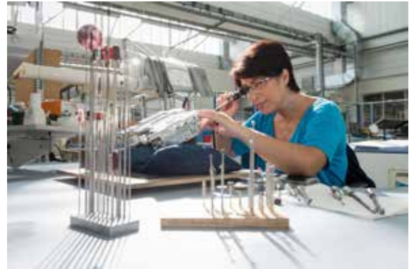
Checking flight control components at Dassault Aviation's Argonay plant SR_130611_081147.jpg

(Ouragan, 1949: 14°; Mystère II, 1951: 30°; Mystère IV, 1952: 38°, Super-Mystère B-2, 1956: 45°). On the Mirage III and IV they became delta wings (60°), which quickly became the design signature of Dassault combat aircraft, up to and including the Rafale. The service entry of the Mirage III C in 1960 marked a turning point in the history of the French air force. It signaled the Mach 2 fighter era in Europe, capable of flying at twice the speed of sound. Then in 1964 Dassault's Mirage IV strategic bomber became the first operational military aircraft in Europe capable of long-range sustained flight at speeds exceeding Mach 2.