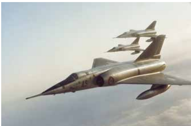
Mirage IV in flight 3014_T-1.jpg

aircraft in Europe fitted with full fly-by-wire analog controls, without a mechanical backup system. Its successor, the Rafale now in service, represents a further leap in technology. The aircraft is totally computer controlled and uses digital technology. The backup controls are analog, and mechanical controls have disappeared for good. The Falcon 7X and 8X bizjets also feature this technology.