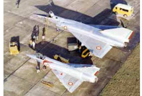
Mirage IV (right) and Mirage III (left) on the ground 90-1949-1.jpg

Shortly after returning to France, in April 1945, he got back into business, quickly designing a new model for the French air force, the MD 315 Flamant transport aircraft. But it was in the emerging field of jet aircraft that the newly named Dassault company would earn its credentials.