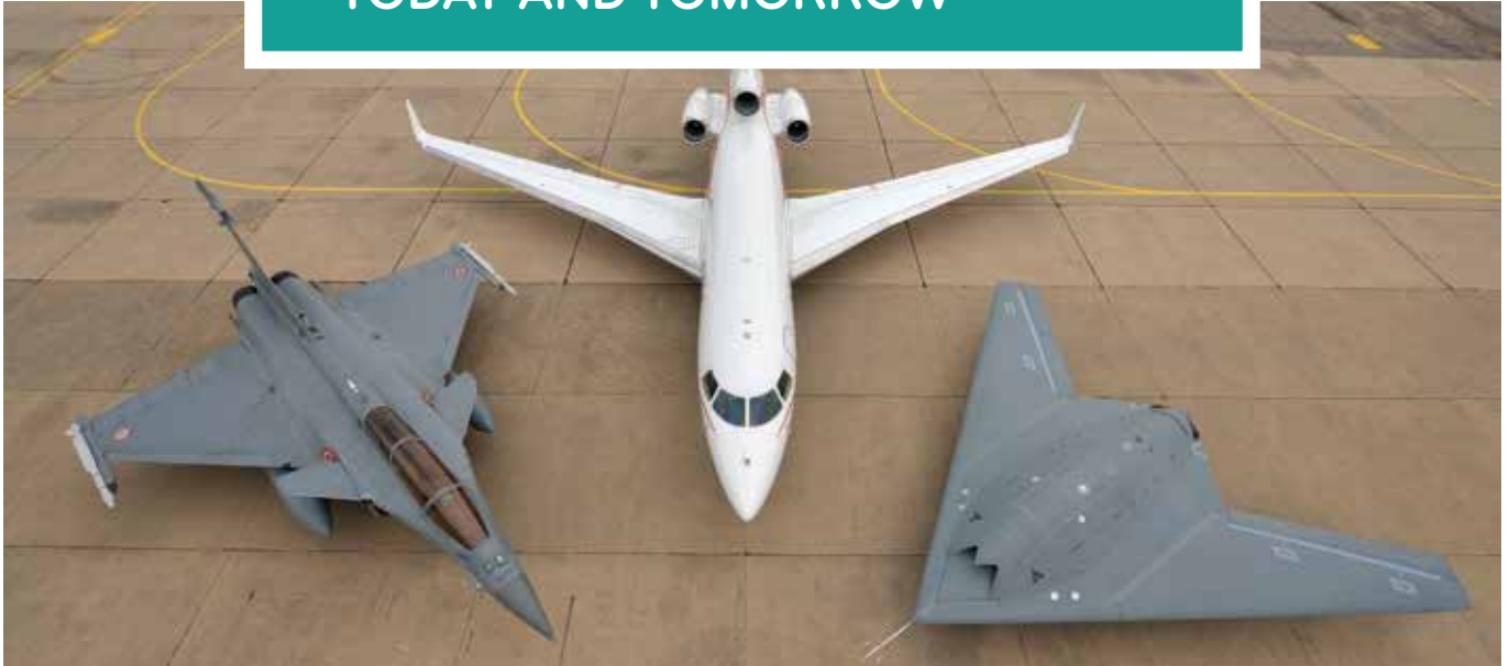
The three aircraft used in Dassault's innovative formation flight: nEUROn, Rafale and Falcon 7X 0331QG_140321_0041r-1.jpg