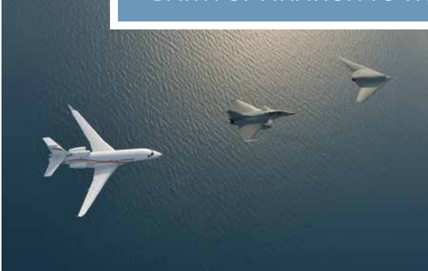
A world-first formation flight of three Dassault aircraft: nEUROn, Rafale and Falcon 7X 0331QA_140320_0057r.jpg

Since the dawn of aviation in the early 20th century, Dassault Aviation has stood out through the design and construction of a large number of aircraft of all different types. From the Éclair propeller in 1916 to the Falcon 8X in 2015, Dassault has turned out over 100 prototypes reflecting the steady progress in advanced aeronautical technology.